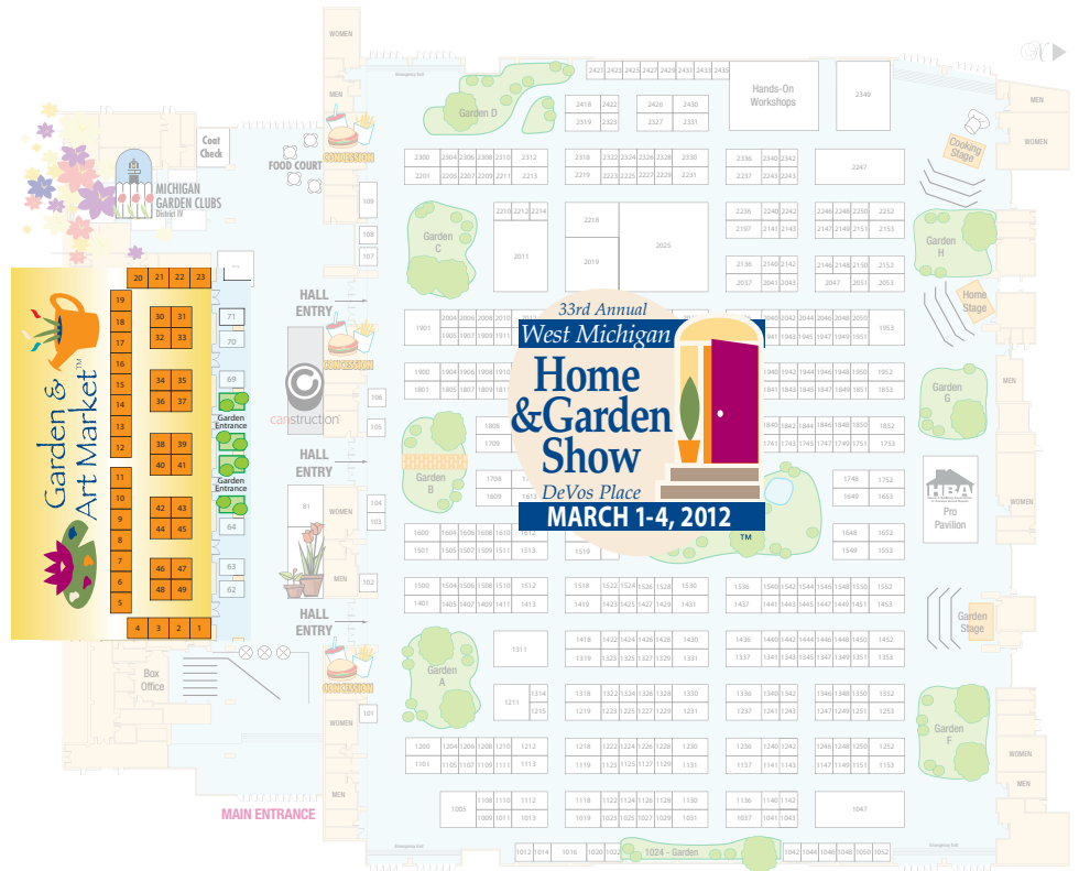
West Michigan Home & Garden Show Floorplan featuring the Garden & Art Market